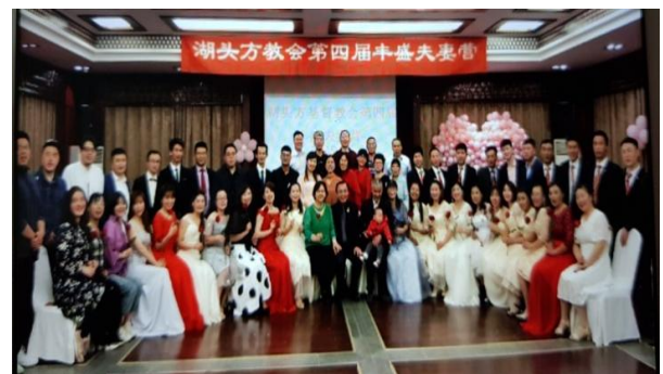
The 4 th Couples Camp of Hutoufang Church