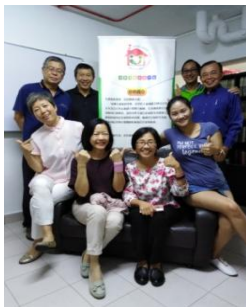
Educator Training in Singapore

One year may end as in the twinkling of an eye, but God's grace is enormous. In particular, He has moved so many beloved brothers and sisters to partner with us in the ministry, so that we do not fall short of hands or finance. This assures us that God has begun and will accomplish His good work in the end. We sincerely thank God and those who have been partnering with us. We pray that God may reward the partnership with His abounding grace and blessings.