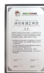
Course Pledge card