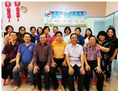
Educator Training for Malaysia Chin Hock Methodist Church