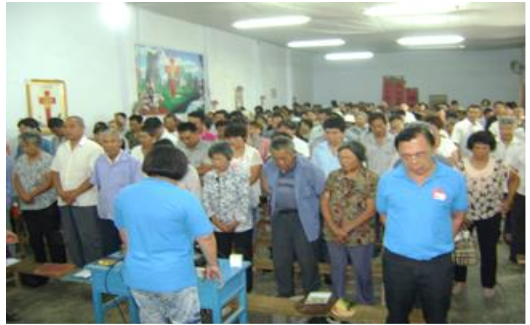
Working with the Hangzhou staff team in a village church

God also wonderfully led a property developer to develop our inheritance into a housing estate. After my brother was apportioned his share, three houses were left for me and they were God's provision for us to establish the Oasis Family Life Enrichment Training centre.