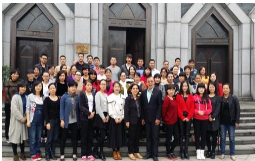
Inspiring students of Wenzhou Bible School

Fortunately, when I was conducting the Family Wellness course at a training centre for full-time Sunday school workers, I realized that God might make use of ordinary preachers and full-time Sunday school workers to develop the Family Life ministry. Hence we stopped sponsoring pastors for the training and began to recruit those students who were godly church workers and willing to submit themselves to the call for such a mission and pay for their food and lodging while they received their training at our centre.