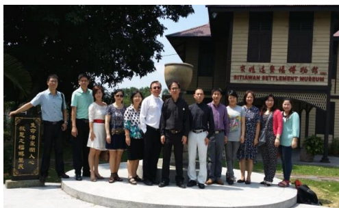
1 st batch trainees at Sitiawan

2015: It had been 40 years since I graduated from Trinity Theological College. It was time for me to affirm my godliness by surrendering all my selfish desires and devote the rest of my life to fulfil what God had called me to do. The call was to build a training centre for equipping as many family life educators as possible to help believers integrate their faith into their family lives so that men and women may play their roles effectively in raising godly off springs for the advancement of God's Kingdom. In this way the body of Christ may build itself up in love, as each family does its work.