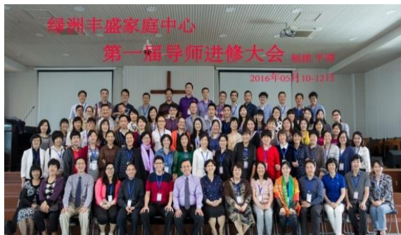
Educators Conference at Pingtan

It was time to consolidate our work by calling all those who still had the