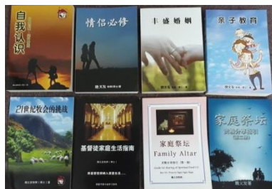
Books for the Family Wellness course series

A Family Life Educators' Association, or rather the Fellowship of the Volunteers and Workers of Oasis Family Life Enrichment Centre, was formed at the end of the conference. This was to enable us to present ourselves as a special task force for the advancement of God's Kingdom by being like-minded, having the same love and being one in spirit and purpose. And most of all, to work together with brotherly affection among the certified educators and the interns for the fulfilment of the mission God has called us to do.