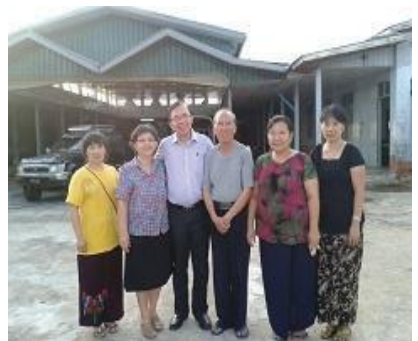
At Myanmar Theological School

Thus it was imperative for us to form teams among the educators (interns) as well as course participants which would be followed up by covenant family groups in order to enhance their capacity of self-control . Members of the teams or groups could encourage one another to overcome the weaknesses of their flesh and work on what they had been inspired to do. We therefore encouraged our interns to recruit members who had the potential of working as team members and bring them for the family life educator training in our centre. Similarly when they conducted any family wellness course, they should work towards forming family covenant groups.