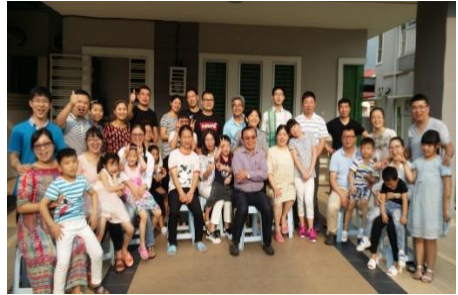
1 st group of Students and Marriage Enrichment camp of Watchman Nee's church

A group of twenty young adults came to our centre for the intensive educator training course during the Chinese New Year holidays. After that, two more batches of students were trained and a Marriage Enrichment Camp was organized successfully by one of the interns during the China National Day holidays. They also organized a seminar to introduce our ministry in other regions of the church. The feedback of the participants was very positive as well. 48 family life educators (interns) were trained for the church within the year and most of them have been actively organizing classes and facilitating the group study of the course. One of the interns even led a group of students to our centre and demonstrated her skills in training and lecturing at the 13 th batch of the Family Life Educator training course. She was then awarded with a golden badge to identify herself as a certified Family Life Educator.