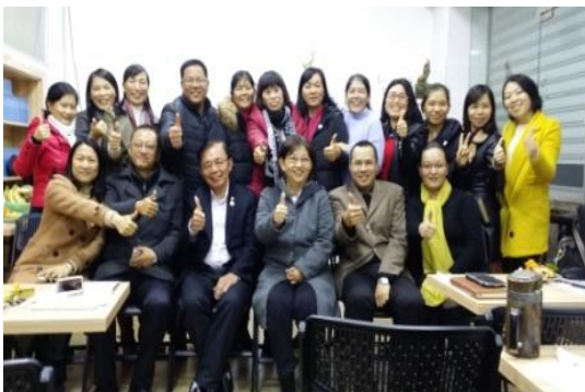
Meeting in Oasis Pingtan Office