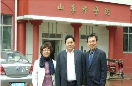
With the principal of Shandong Theological Seminary

2010: By faith , the Oasis Family Life Enrichment Centre was registered in Singapore in the beginning of the year with our wholehearted belief that God would provide the resources and the direction for the development of the ministry that is urgently needed in this century. The ministry's aim is to bring restoration to marriages and