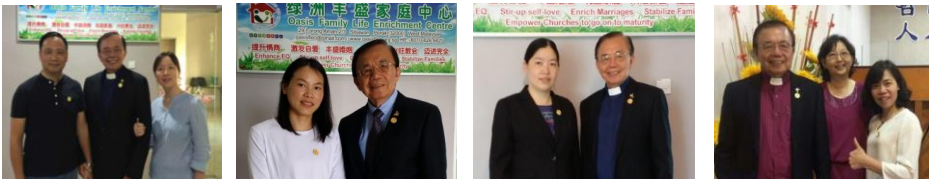
Certified Family Life Educators awarded the golden badges at Sitiawan Centre

We thank God for shaping the Oasis Family Enrichment Centre over the past eight years. The centre has been empowered to be more pragmatic and effective in all that it would be doing. We hope many more golden badges will be awarded yearly to our interns. If it is the Lord's will, each of the certified educators shall flourish wherever he or she may be. Ultimately, China will be able to bless other nations through the equipping of the saints for the ministry of building up the body of Christ through restoring marriages and families in the light of God's blueprint for marriage and family. We therefore, invite you to join us and pray earnestly, "Thy will be done on earth as it is in heaven. Amen."