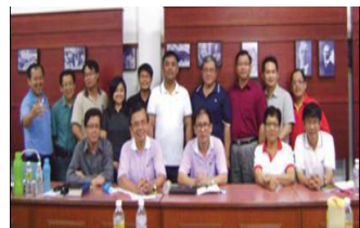
Workshops with pastors from Pingtan & Malaysia with the book