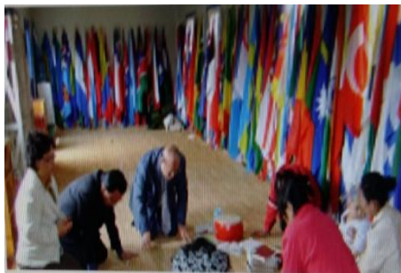
Praying for the salvation of all nations