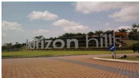
Where our JB home is

2011: God provided me with a house in Horizon Hills, Johor Bahru, Malaysia, as an office to extend our family therapy ministry and a quiet environment for me to write the textbooks for the Family Wellness course series and the Devotion Guide for Family Altar series.