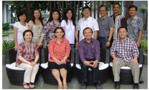
With the Bandung Church

2013: Through working with self-control and complete trust in the help of the Lord, the textbooks for Self-Awareness and Marriage Enrichment courses were published within a year. The programmes that we had in Indonesia, Myanmar, China, Singapore and Malaysia kept us very busy and without self-control and trusting fully in the Lord, this urgently needed project would not have been accomplished.