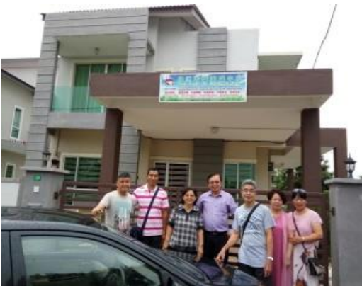
Sitiawan Training Centre

I could perceive all these events as a divine indication for me to have a long-term commitment to the training of the Family Life Educators for China. Thus I need brothers and sisters in the Lord to pray with me for perseverance and health in order to keep the ministry going.