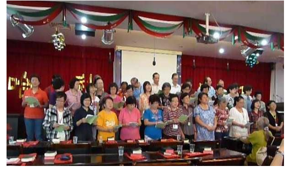
Presenting Song Item @ Halleluiah Church in Haikou

Our participants seemed to enjoy every talk and workshop session of the camp. Most of them shared freely by following the guidelines for sharing. It helped us to get to know one another better. It inspired most of us to affirm our position and value as senior adults and to rededicate our lives for the service of the Lord. It encouraged us to live a happy and meaningful life. All our activities in the camp had been inspiring and we felt the presence of the Holy Spirit. The few days of our Hainan Island tour had been a joyous experience to me. Though we encountered a typhoon, we experienced the protecting hands of God. Praise the Lord.