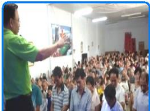
30 Husbands came to the Lord in 3 Marriage Enrichment camps

Thank God that after some explorations, counselling and prayers, her husband kicked off his addiction and their son began to open himself for sharing with his parents.