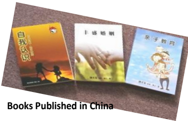
Books Published in China

Upon returning from the camp, a pastor was so fired-up that within a month he conducted an ME Camp for his own church members by sharing messages from our book. He received a very positive feedback from the participants. As such, he believed that it would be more effective if he were to receive some training. He therefore invited me to conduct a basic FLE course for the pastors in his district at the beginning of next year.