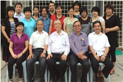
First Educator class from China with Chin Lian Principal in JB

We were blessed by Chin Lian Bible Seminary who rendered its hostel free of charge. This provided much financial relief to our first batch of students who came to Singapore in April this year for their training.