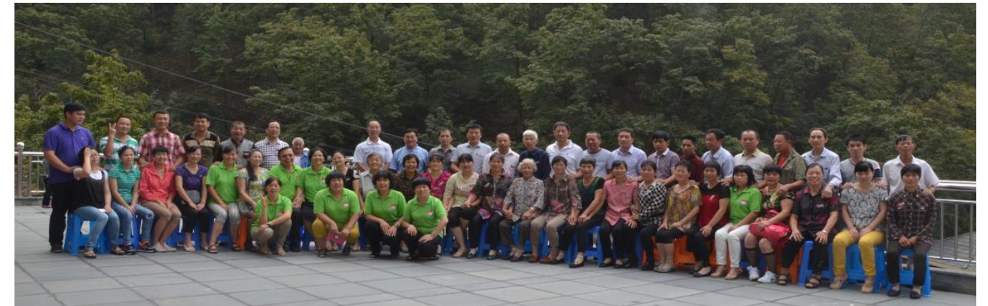
Hangzhou LingAn Couple's Camp & the Eden Garden's Educators Team

422A Telok Blangah Road Singapore 098848 Tel: 6274 7480 Hp: 9070 0336 Email: oasisflec@gmail.com Website: www.oasisflec.org.sg 29 Lorong Aman 2/3, Sitiawan 32000, Perak, Malaysia. Tel: +6010-826 5820