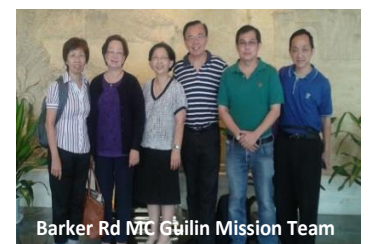
Barker Rd Mt Guilin Mission Team

Barker Road Methodist Church has been involved in the China Mission for