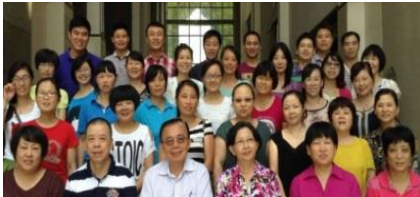
Class of Educator training at Yuhang

When the pastor of Wuchang Christian Church in Hangzhou learnt that we were conducting an FLE training at Yuhang, he requested his wife to attend the training. Consequently, she invited me to speak at the ME programme which she organised in her church. At the closing session, the participants commented that our programme was a treasure for China. The pastor felt that the ministry would be more effective in the church if he also received training in the Family Life ministry. He therefore plans to come to Singapore for the three-week FLE training next year.