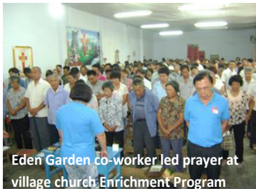
Eden Garden co-worker led prayer at village church Enrichment Program

spirit of Caleb and was humble and creative. He invited us to conduct an ME programme and a parenting course at his village church. This led us to personally experience village life in China: we ate simply but lived healthily. The only difficulty for us was getting used to toilets with no flushing system. The church members were very eager to learn from us. They spent a whole day listening to the teaching on family issues and still